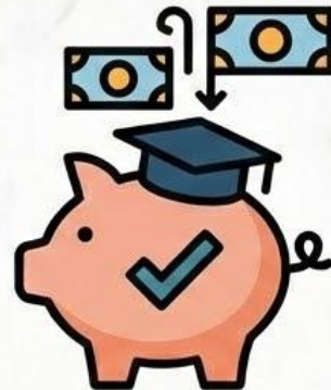
Empowerment Scholarship Accounts